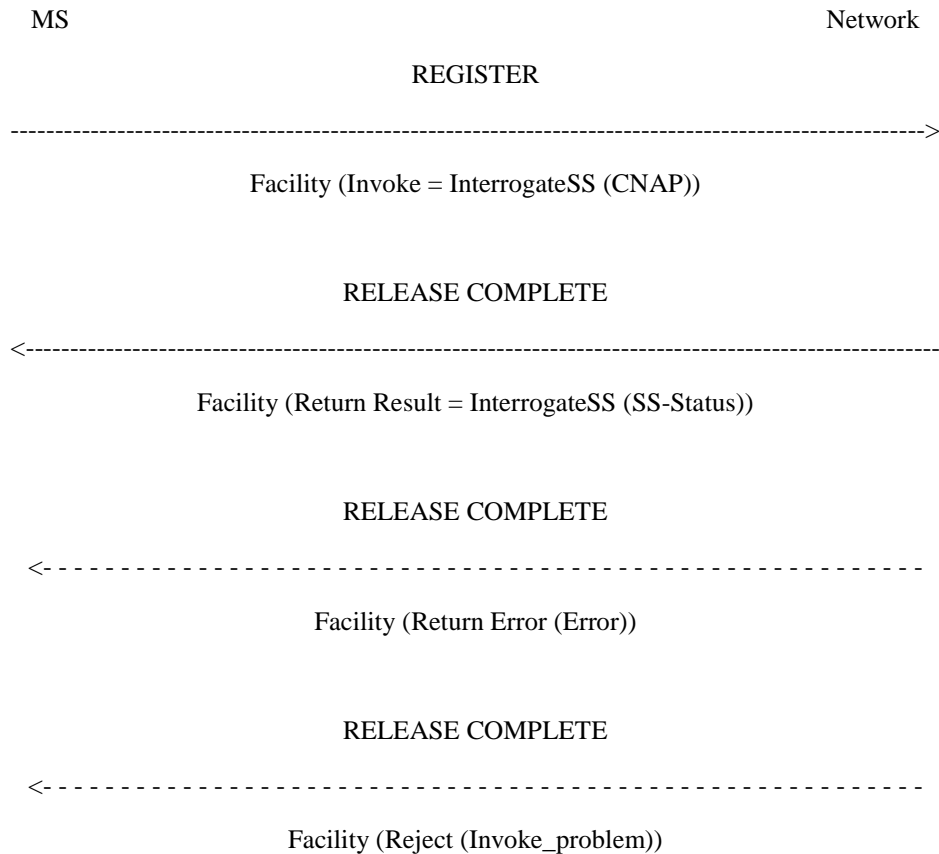
Figure 2: Interrogation of calling name identification presentation

The mobile subscriber can request the status of the supplementary service and be informed if the service is provided to him/her.