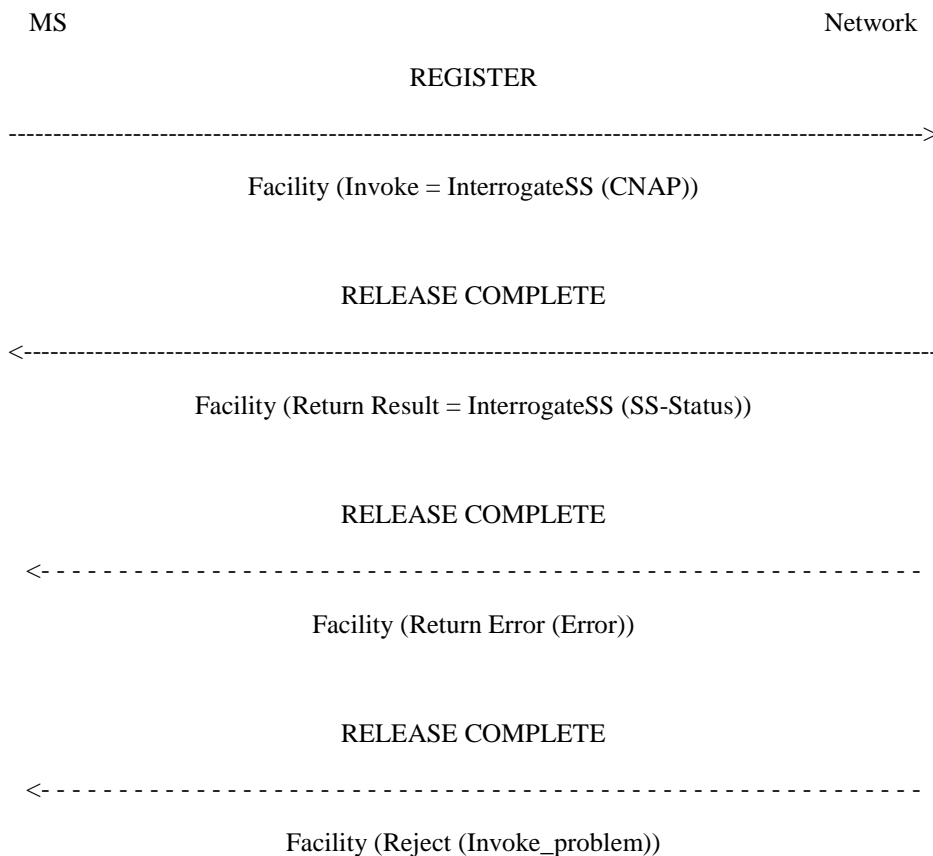
Figure 2: Interrogation of calling name identification presentation

The mobile subscriber can request the status of the supplementary service and be informed if the service is provided to him/her.