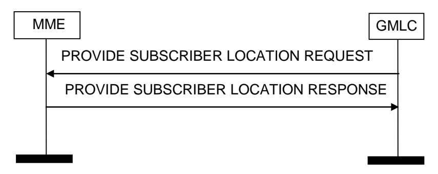
Figure 6.2.2-1: Provide Subscriber Location procedure. Successful operation.

The GMLC initiates the procedure by sending a PROVIDE SUBSCRIBER LOCATION REQUEST message to the MME. This message carries the type of location information requested (e.g. current location and optionally, velocity), the UE subscriber's IMSI, LCS QoS information (e.g. accuracy, response time) and an indication of whether the LCS client has the override capability.