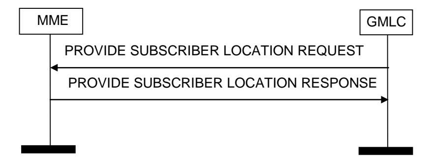
Figure 6.2.2-1: Provide Subscriber Location procedure. Successful operation.

The GMLC initiates the procedure by sending a PROVIDE SUBSCRIBER LOCATION REQUEST message to the MME. This message carries the type of location information requested (e.g. current location and optionally, velocity), the UE subscriber's IMSI, LCS QoS information (e.g. accuracy, response time) and an indication of whether the LCS client has the override capability.