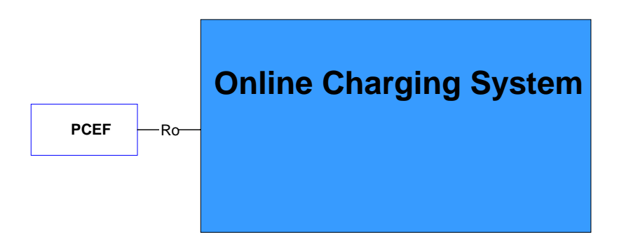
Figure 4.3-1: PS domain online charging architecture

PS domain online charging based on P-GW functions with included PCEF is specified in the present document, utilising the Ro interface and application as specified in TS 32.299 [50]. The reason for this alternative solution is that operators may enforce the use of HPLMN P-GWs in the case of roaming, hence P-GW service control and charging can be executed in the HPLMN in all circumstances. The P-GW based PS domain online charging architecture is depicted in figure 4.3-1.