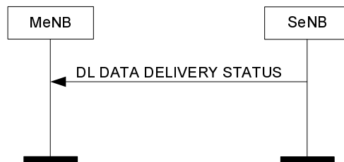
Figure 5.4.2.1-1: Successful Downlink Data Delivery Status

After being reported to the MeNB, the SeNB removes the respective PDCP sequence numbers.