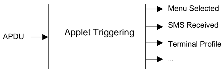
Figure 3: toolkit applet triggering diagram

The ME shall not be adversely affected by the presence of applets on the SIM card. For instance a syntactically correct Envelope shall not result in an error status word in case of a failure of an applet. The only application as seen by the ME is the SIM application. As a result, a toolkit applet may throw an exception, but this error will not be sent to the ME.